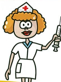
el/la enfermera/o the nurse