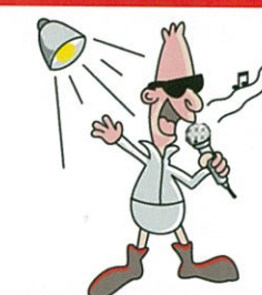
la/el cantante the singer