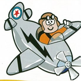
el piloto the pilot