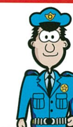
el policía The police