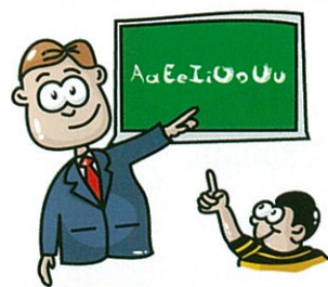
la/el profesor(a) the teacher