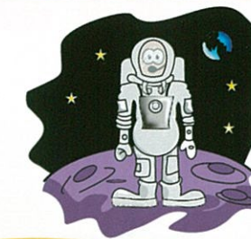
la/el astronauta the astronaut