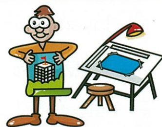
la/el arquitecto/a the architect