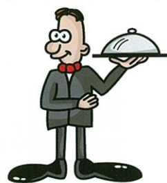
la/el mesero/a the waiter/waitress