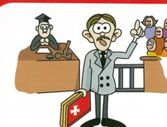
la/el abogado/a the lawyer