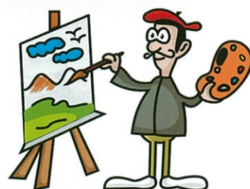
la/el pintor(a) the painter