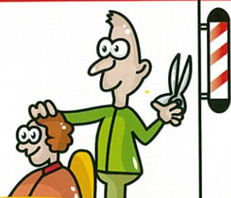
el peluquero the barber