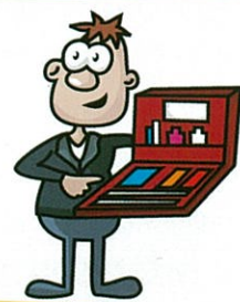
la/el vendedor(a) the salesperson