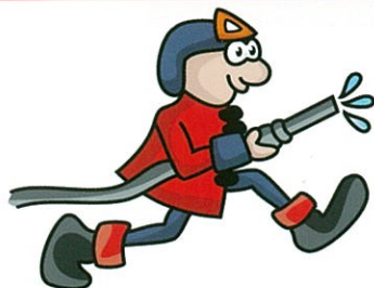
el bombero the fireman