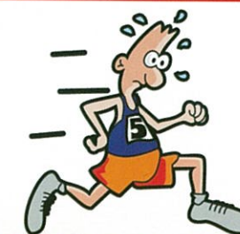
la/el atleta the athlete