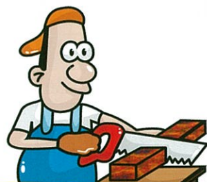
el carpintero the carpenter