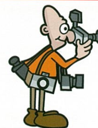
la/el fotógrafo/a the photographer