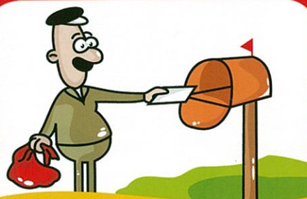
el cartero the mailman