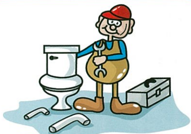
el plomero the plumber