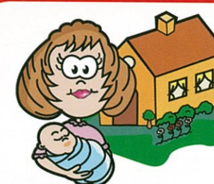
el ama de casa the housewife