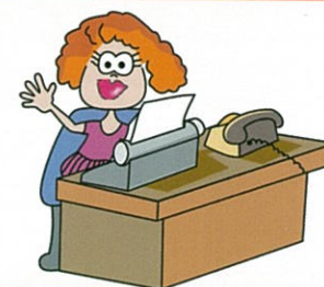
el/la secretaria/o the secretary