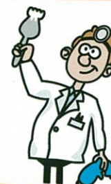
la/el dentista the dentist